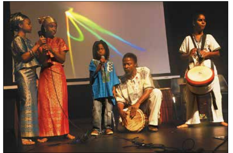
Live entertainment was a hit at last year's event.

feature live entertainment, refreshments and network opportunities. The goal is to help keep urban youth out of the criminal justice system and to alert the audience to the constructive activities and organizations that are currently working on these issues.