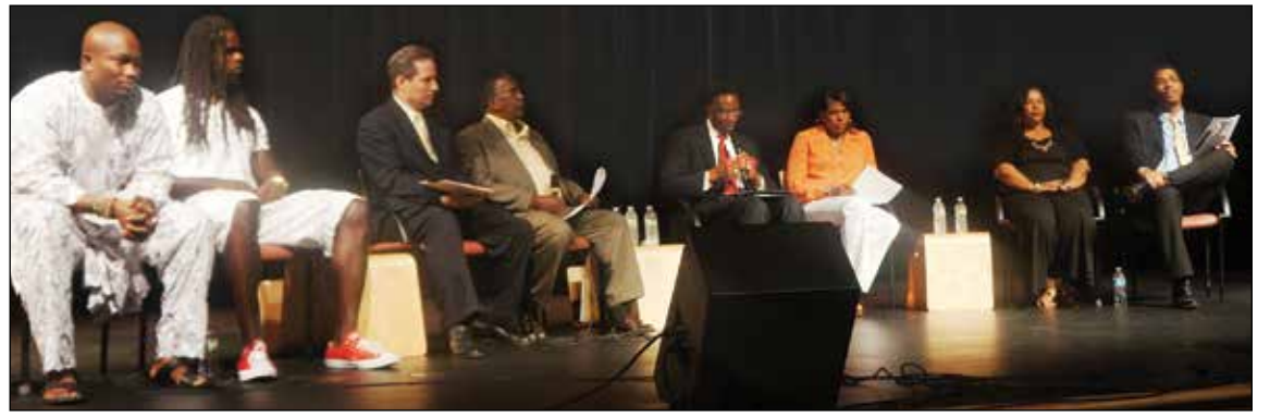
Hand-picked panel for Black on Black Crime Solutions.